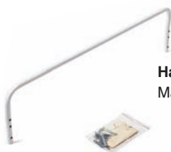
Handrail Made from Steel